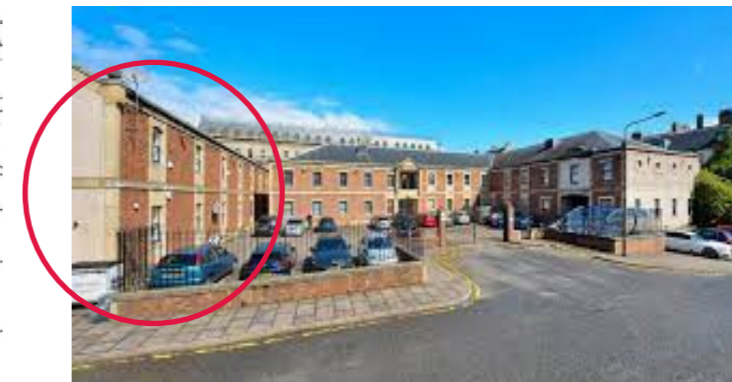
Image of existing site